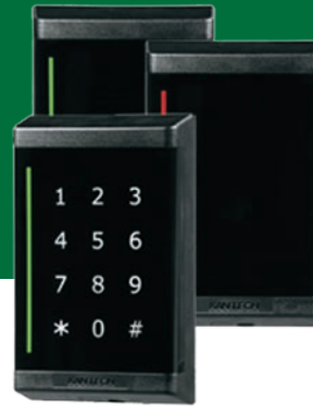
KT-SG-MT-KP, KT-SG-MT, KT-SG-SC