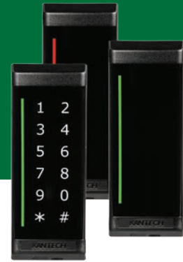
KT-MUL-MT-KP, KT-MUL-MT, KT-MUL-SC